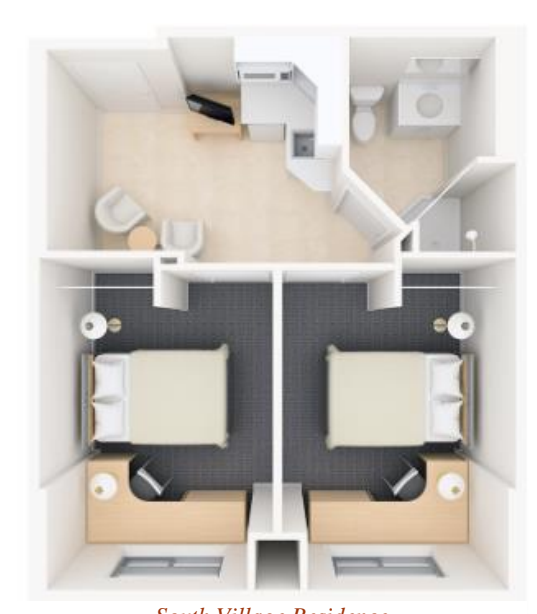
South Village Residence

Disclaimer: Suite may not be exactly as shown